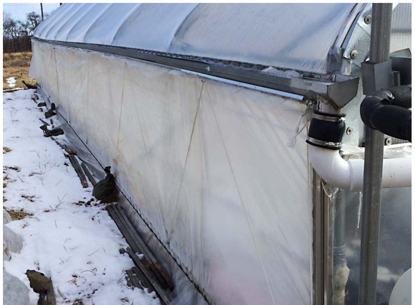
Some high tunnel manufacturers offer substantial gutter systems to collect water for irrigation.

Rainwater runoff can be a concern in an urban setting. Stormwater is collected and concentrated on impermeable surfaces and can wash sediment and contaminants into local watersheds. By creating healthy, functioning soils, urban farms can help reduce this runoff. High tunnels can concentrate a lot of rainwater and should be designed as mentioned above to handle that water. Rainwater collection systems can be used to capture the precipitation that falls on the high tunnel and use it for irrigation purposes on the farm. A simple gutter system can be installed on any high tunnel, using parts available from home-supply centers. Some high tunnel manufacturers sell gutters for their high tunnels. Either way, the water can be collected into a large tank and