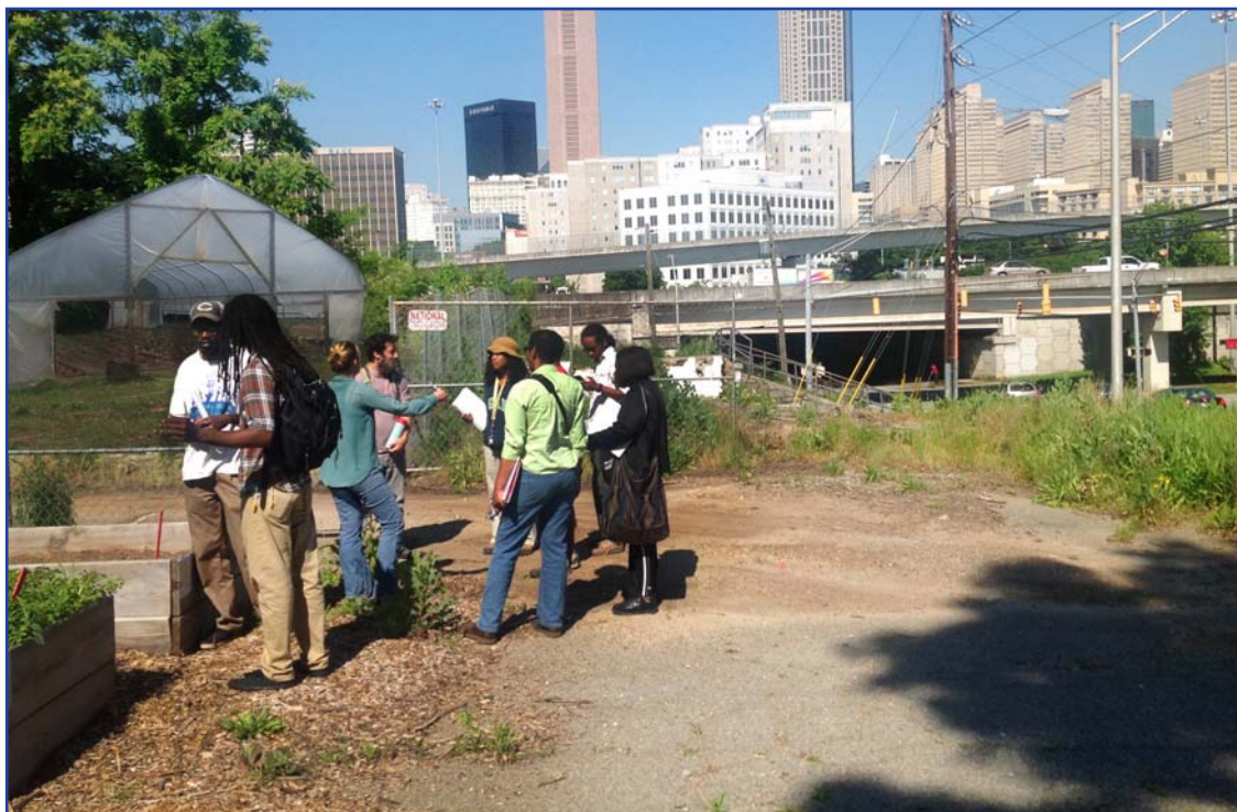
The use of high tunnels in urban agriculture can reduce risks and increase profitability.