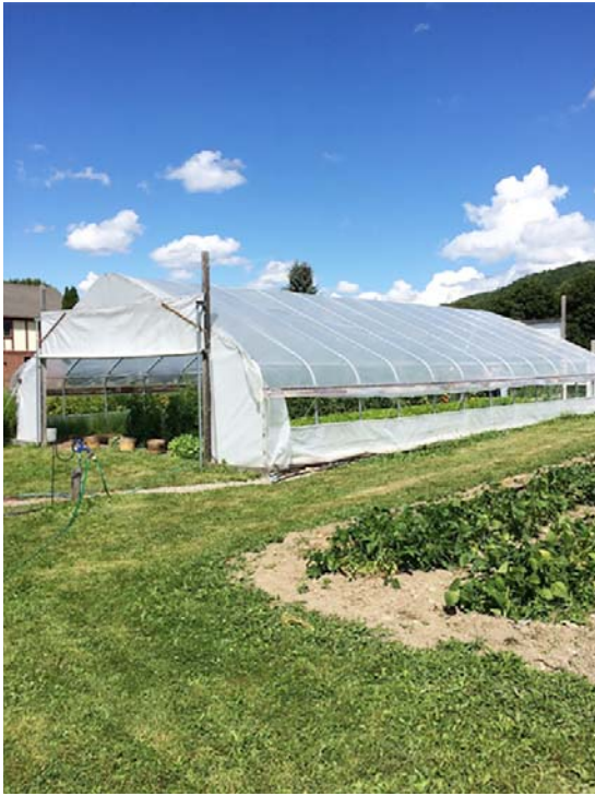
A Gothic tunnel with roll-down sides to protect plants from the wind.

simple semi-circle, ending either at the ground or at the top of a straight side.