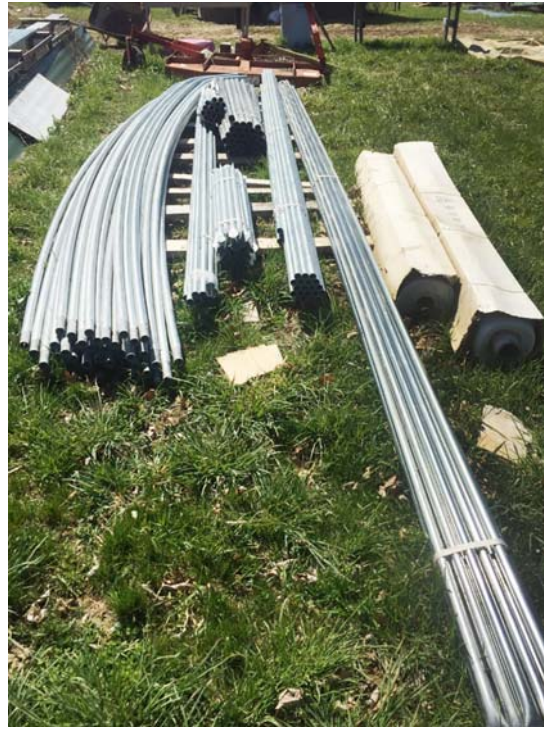
This shows how much space the components of a high tunnel take up. You can stack the parts in the order that you will need them or spread them out a bit for easy access, as in this picture.

The logistics of setting up a tunnel on an urban farm can be challenging. The high tunnel components are usually delivered on a small flatbed truck. The pieces are not conducive to packing on pallets, so unloading the truck is usually done by hand. Have a good plan as to where you will place the components. If you don't have the room to spread them out, stack the pieces with the components that you will need last in the construction on the bottom. Stack in reverse order, with the ground stakes, which you will need in the first part of construction, on top. If you don't plan to build right away, the components should be out of the way of the farm's day-to-day operations, but they should be located close to the final tunnel location for construction efficiency. Don't store them inside the area where the tunnel will be