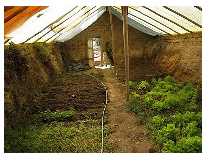
"Walipini 2" by Aerin Aichi is licensed under CC 2.0 Generic

Walipinis are another type of protective structure. The term "walipini" comes from the Aymara Indian language and means "place of warmth." Walipinis are essentially large underground hotbeds that do not require external heat sources. Instead, they leverage the consistent ambient geothermal heat from the surrounding ground to keep them warm. They are typically built about six feet underground and earth is used for the walls, so costs of construction tend to be lower than for above-ground greenhouses. The roof is made of plastic sheeting, which also allows for